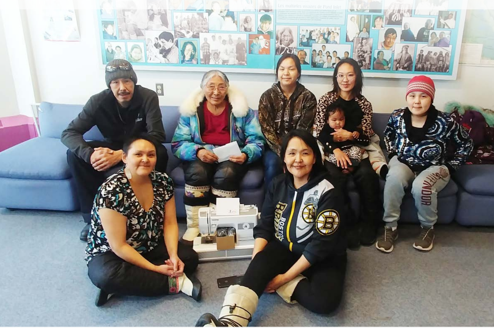
Participants from a PMC pre-employment training program in Pond Inlet, Nunavut, pose with a sewing machine donated by PMC to the local Women's Auxiliary Group.

PMC has built a strong reputation as a trusted advisor to Indigenous organizations and assists many organizations and communities with a diverse range of needs.